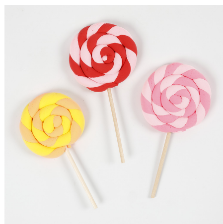
6 Here are finished lollipops in different colours.