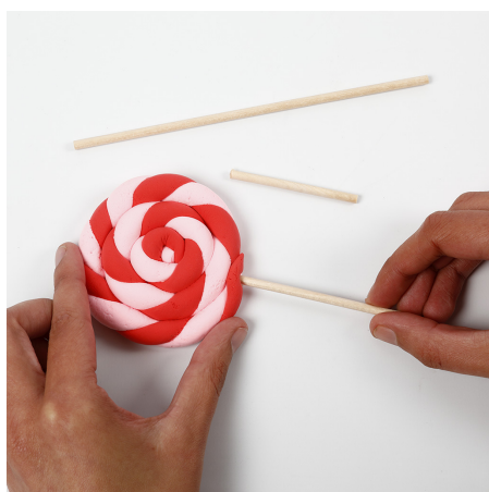
5 Finish by inserting a wooden stick into the lollipop. Trim the wooden stick to your chosen length.