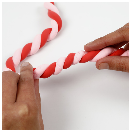
2 Twist the two sausages around each other.