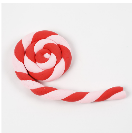
4 Now twist the striped sausage around itself as shown in the photo.