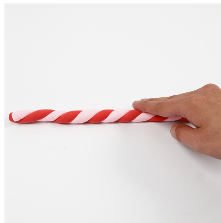
3 Roll the striped sausage until it's even.