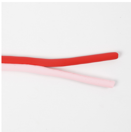
1 Make a lollipop by rolling two long sausages from Silk Clay in two different colours.