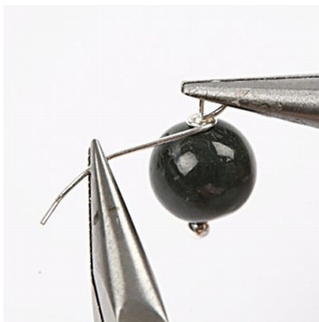
2 Form a loop by twisting the head pin around itself.