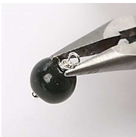
4 Squeeze the end into place.