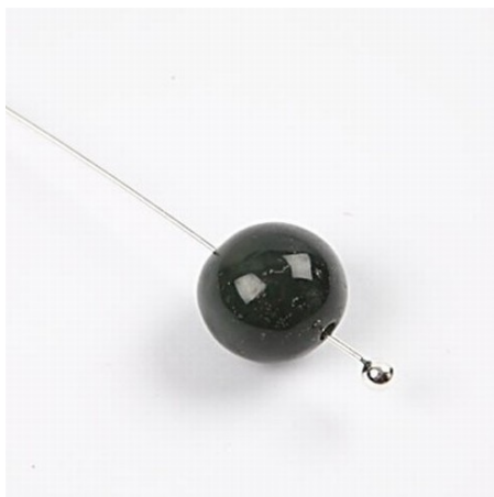
1 Thread an Indian agate bead onto a head pin.