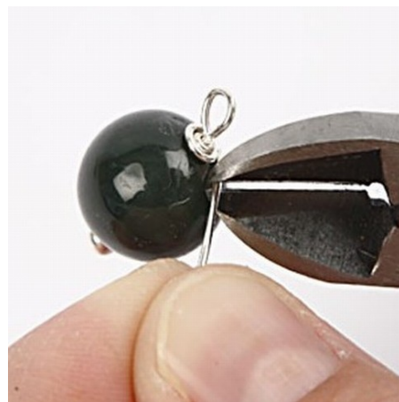
3 Cut off the excess head pin.