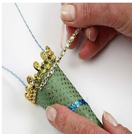
5 Also attach a small strip of decorative trim with rhinestones onto the top edge of the cone.