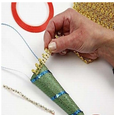
4 Cut a piece of gold decorative trim and glue it onto the top edge of the cone using double-sided adhesive tape.