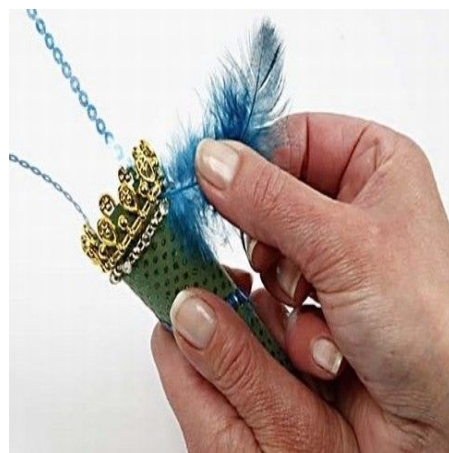
6 Finally attach a small feather on top by the decorative trim.