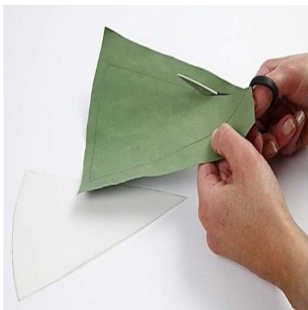
1 Draw the cone using the template and cut out.