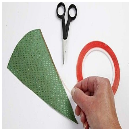
2 Assemble the cone with double-sided adhesive tape.