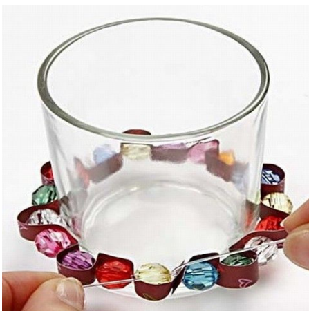
4. Arrange the weaving paper strips around a candle holder and tighten so that the beads are lying close together. Tie another couple of knots.