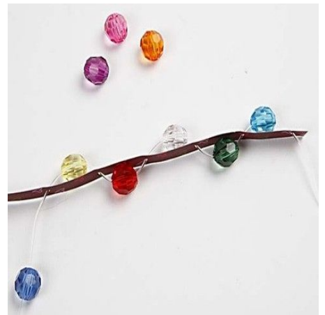
3. Thread the elastic beading cord up through the hole, thread on a bead and thread the beading cord down through the next hole.