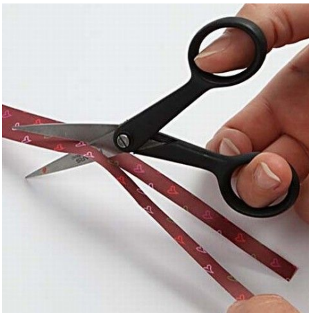
1. Half a small weaving paper strip lengthwise.