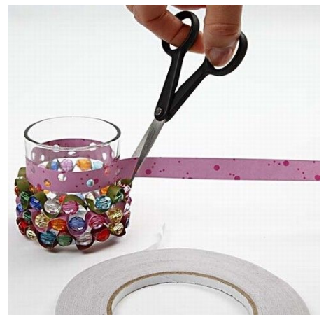
6. Make holes in a weaving paper strip and arrange the strip tightly around the candle holder with double-sided adhesive tape.