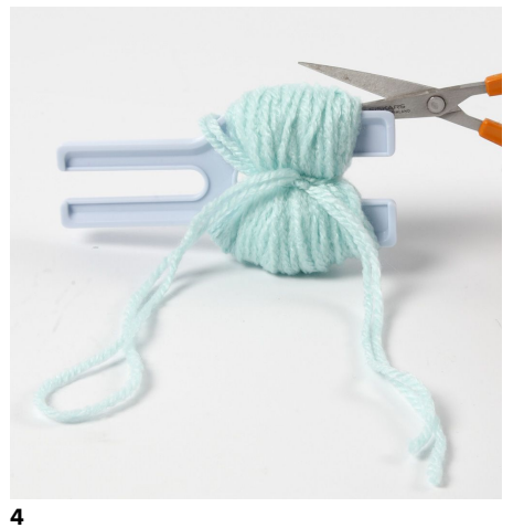
Cut the yarn open on one side of the tool. The tool has a deep groove all the way around to allow room for the blade of the scissors.