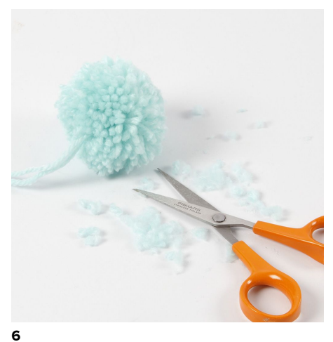
Trim the pom-pom to make it as round as possible. (Leave two of the long yarn ends for tying and cut off the other two yarn ends).

Tighten the doubled-over piece of yarn again and cut the yarn open on the other side of the tool. Tighten one more time and finish with a couple of double knots.