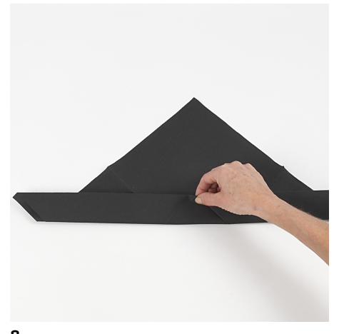
Fold the long end so that the fold is approx. 4.5 cm wide.