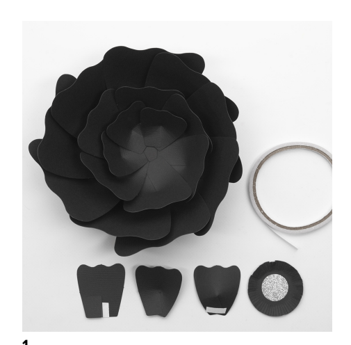
Assemble the paper flowers as shown on the back of the packaging.