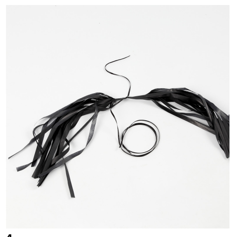
Tie a ribbon in the middle. The ribbon must be long enough to be used for hanging and for attaching onto the balloon.