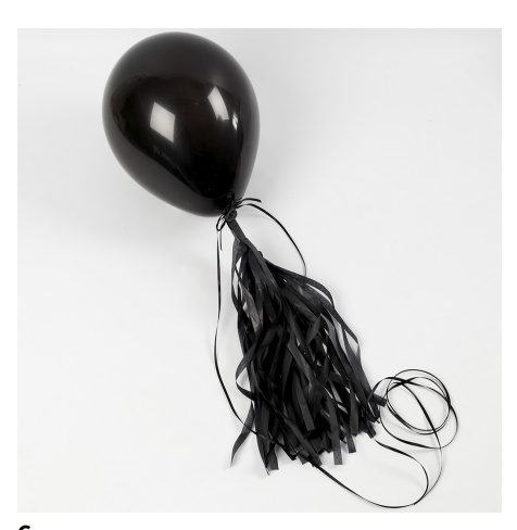
Tie on the tassel.