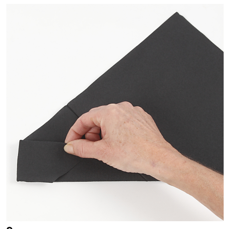
Turn over the napkin and bend one end towards you.