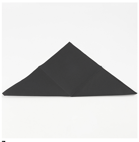
7 Unfold the napkin and then fold it in the middle as shown in the photo.