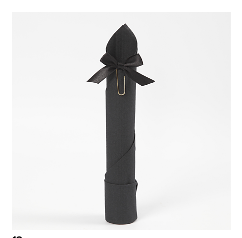
12 Attach a paper clip with a bow for the finishing touch.