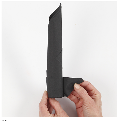
10 Roll the napkin to a tower.