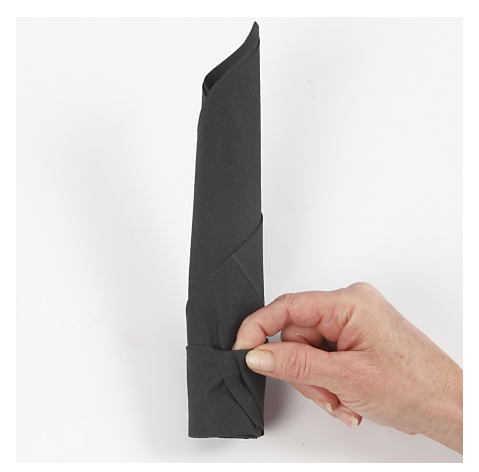
11 Fold the end to secure the napkin and to hide the end.