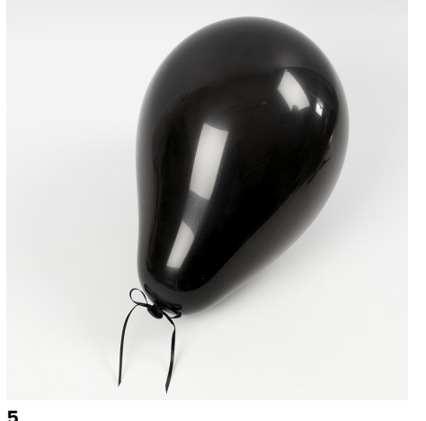
Fill the balloon with helium. Tie a knot and tie a ribbon onto the balloon.