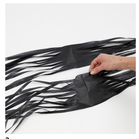
Put two tissue paper tassels together.