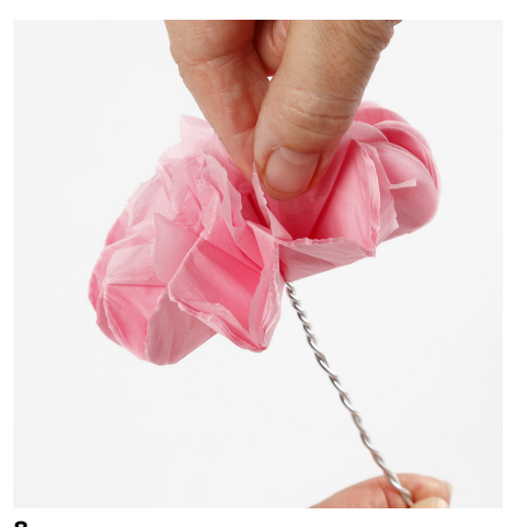
Continue with one layer at a time. When pulling the last couple of layers, it may be necessary to pull up the layers fold by fold.