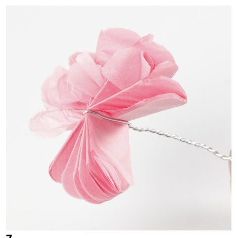
Shape the flower. The easiest way is to hold the layers in one hand whilst pulling one layer at the time towards the middle of the flower with the other hand, turning the flower at the same time.