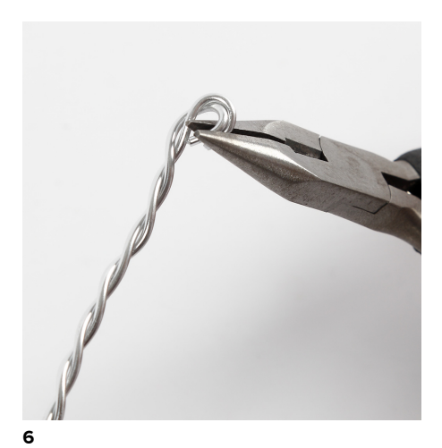
Secure the ends by twisting them to form a loop.