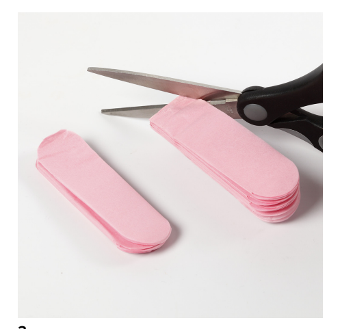
Cut round ends using the other end as a template.