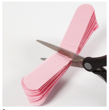
Cut the pom-pom in half. Use a good pair of scissors to cut cleanly through all the layers.