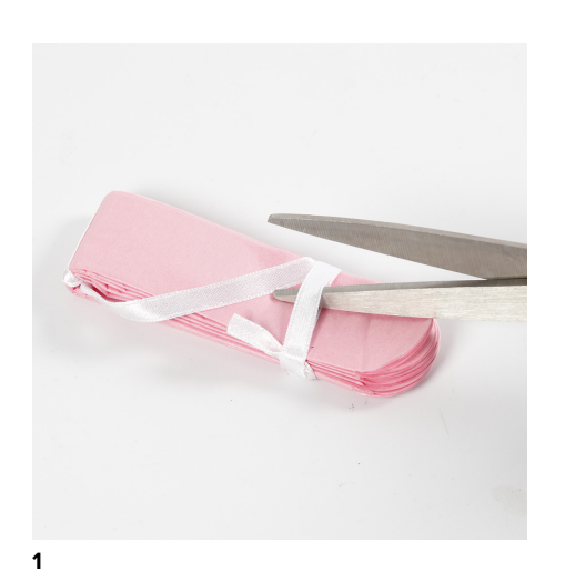
Cut away the ribbon from the tissue paper pom-pom.