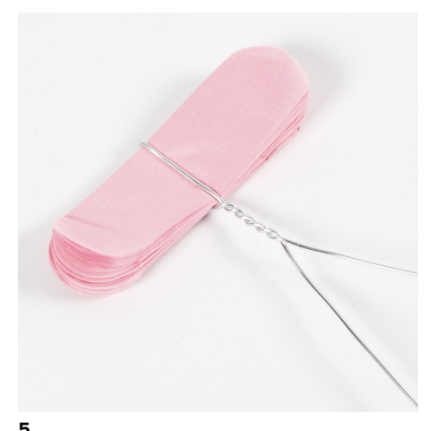
Place the bonsai wire around the flat pom-pom and twist the ends of the bonsai wire all the way to the end.