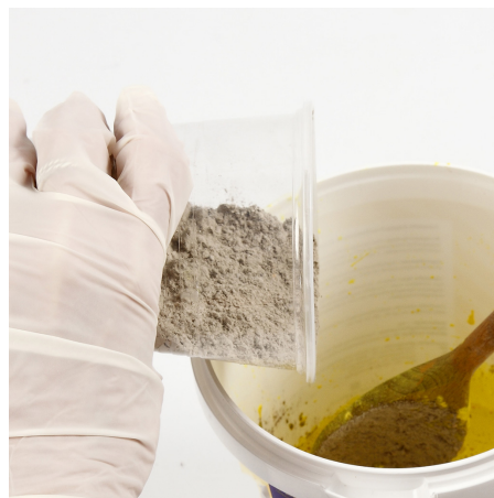
3 Stir Concrete Craft into the mixture until a smooth consistency is reached. If the consistency of the mixture is too dry, add a tablespoon of water. If the consistency of the mixture feels too wet, add another tablespoon of Concrete Craft. The consistency of the mixture needs to be firm and musn't be too thin.