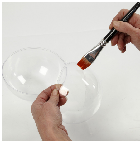
1 Coat the inside of the moulds with cooking oil.