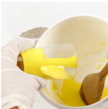
2 Mix craft paint and water.