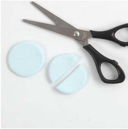
7 Roll out the Silk Clay flat and cut two circles measuring approx. 4 cm in diameter for the large turtle and 3 cm in diameter for the small turtle. Cut the circles in half.