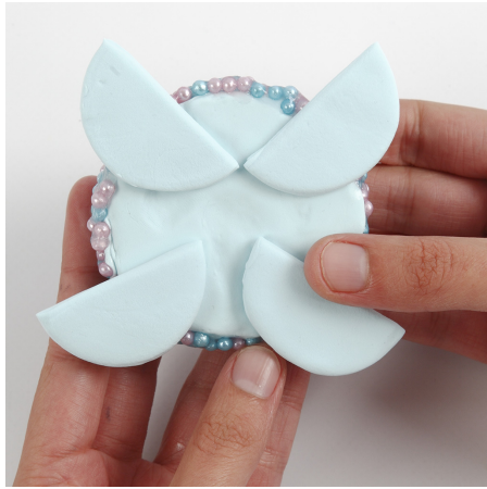
8 Attach the semi circles underneath the bottom as shown in this photo.