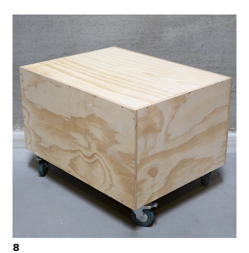
The podium is now finished.