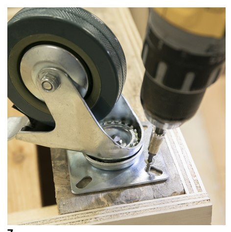
Screw on the casters.