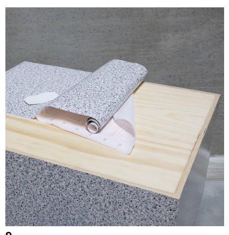
The self-adhesive film fits across the width of the 45 cm wide podium. Start with the sides and make sure to start away from the edge on one side, so that the foil can overlap. Finish with the top board; attach the foil 2 cm over the sides so that you can cut a notch for the corners to be stuck down over the sides.