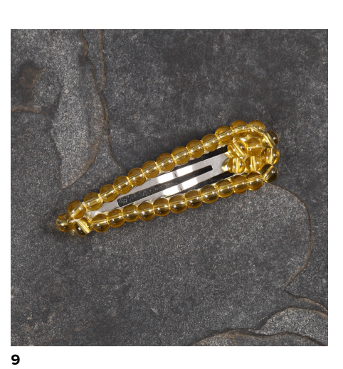
The finished hair clip.

Secure the end of wire on the back of the hair clip.