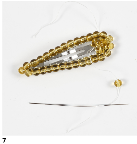
Sew on the last (fourth) bead.