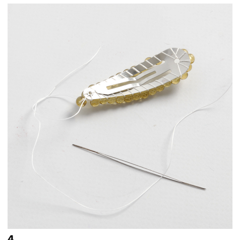
Tie the wire ends together firmly to secure.

Sew around the hair clip; make a stitch between each bead. Finish at the tip of the hair clip by sewing on another glass bead.