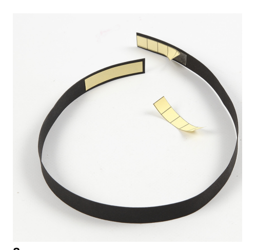
Cut a 50 cm faux leather paper star strip for hanging the wall clock. Cut two pieces of double-sided foil tape the same width as the faux leather paper star strip and attach a piece at each end.