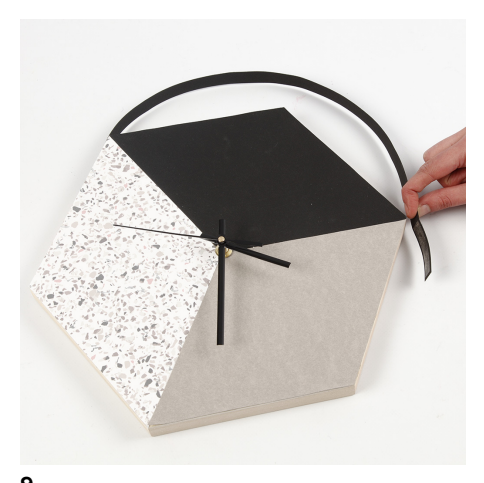
Attach the ends of the faux leather paper star strip onto each side of the wall clock and press firmly.