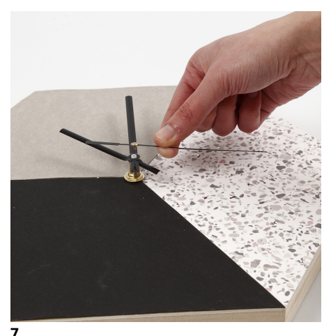
Assemble the clock mechanism as illustrated on the packaging.