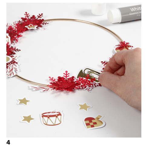
Attach the card cut-outs between the snowflakes using a glue stick or glue them directly onto the metal ring.