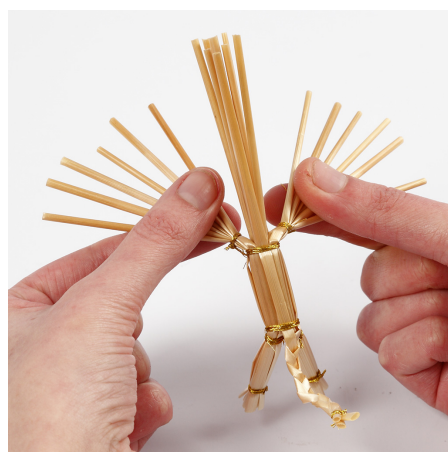
6 Make two front legs by gathering two bundles of six straws at the other end. Tie each bundle together at the top and the bottom with gold thread. Trim the excess straw.