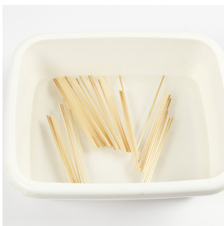
1 Let the straws soak in water for approx. 4 hours.