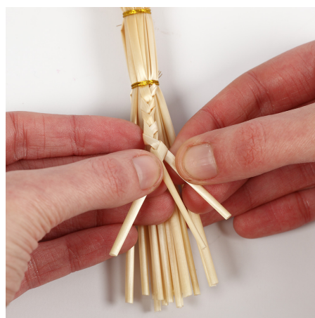
3 Select three straws from one end and plait the tail. Secure the plait with gold thread.