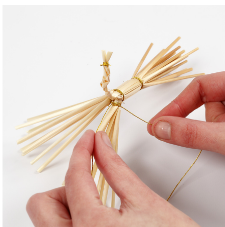
4 Make two hind legs underneath the tail by dividing the rest of the straws into two bundles of nine. Tie each leg together with gold thread at the top.