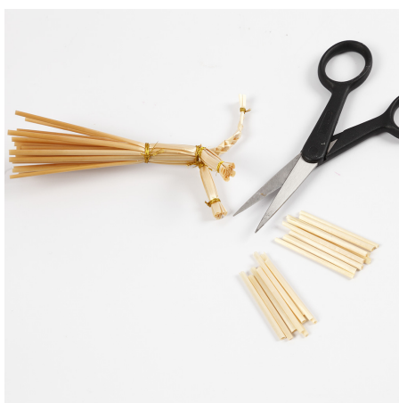
5 Tie each leg together with gold thread at the bottom. Each leg should measure approx. 4.5 cm. Cut off the excess straw.