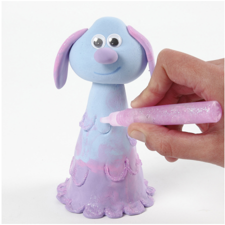
15 Draw details on the body and the ears with pink glitter glue.