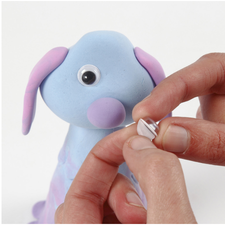
14 Attach self-adhesive eyes.