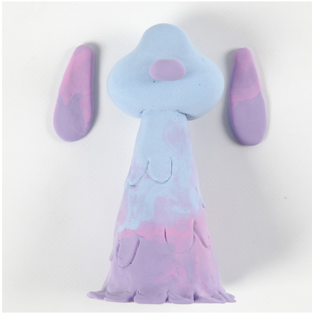
13 Roll a nose from a small amount of purple Silk Clay and attach the nose. Mix a small amount of pink and purple Silk Clay. Model the ears as shown in the photo and attach them onto the head.