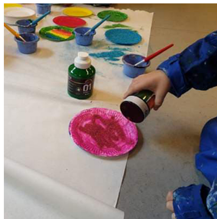
3 Add colourful dots to the Corona monster by attaching painted paper plates decorated with glitter.