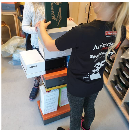
1 Glue shoe boxes together with gaffer tape to make a large body.