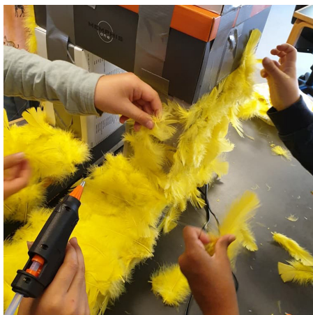
2 Attach down with a glue gun to make the monster furry.